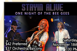
Stayin' Alive One Night of the Bee Gees Saturday, Nov 18 - $37/$42