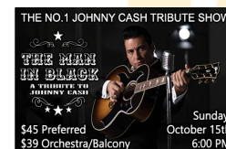
The Man in Black Johnny Cash Tribute Sunday, Oct 15 - $39/$45