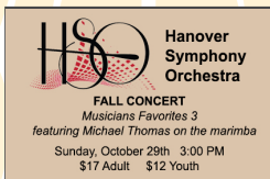
Hanover Symphony Orchestra Fall Concert Sunday, Oct 29 - $17/$12