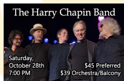
The Harry Chapin Band Saturday, Oct 28 - $39/$45