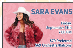
Sara Evans Friday, Sept 15 - $69/$79