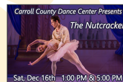
Carroll County Dance Center Presents: The Nutcracker Saturday, Dec 16 - $35/$25/$20 Additional $5 Day of Performance