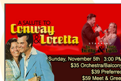
A Salute to Conway & Loretta Sunday, Nov 5 - $35/$39