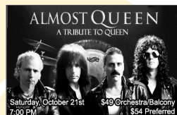
Almost Queen A Tribute to Queen Saturday, Oct 21 - $49/$54