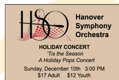
Hanover Symphony Orchestra Holiday Concert Sunday, Dec 10 - $17/$12