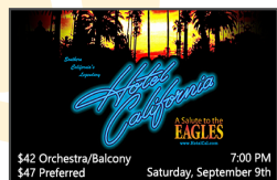
Hotel California A Salute to the Eagles Saturday, Sept 9 - $42/$47

Purchase Tickets online at TheEich.org OR Contact the Box Office 717-637-7086, Monday – Friday 10am to 2pm