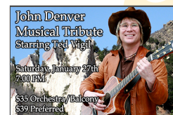
John Denver Tribute Saturday, Jan 27 - $35/$39