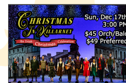
Christmas in Killarney Sunday, Dec 17 - $45/$49