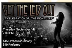
Get the Led Out A Celebration of "The Mighty Zep" Thursday, Sept 14 - $45/$49