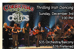
Christmas with the Celts Sunday, Dec 3 - $35/$39