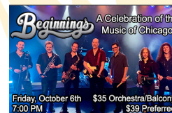
Beginnings A Tribute to Chicago Friday, Oct 6 - $35/$39