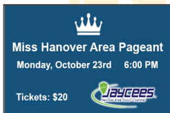
Miss Hanover Pageant Monday, Oct 23 - $20