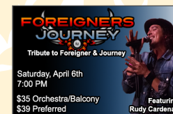
Foreigners Journey Tribute to Foreigner & Journey Saturday, Apr 6 - $35/$39