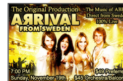
Arrival From Sweden The Music of ABBA Sunday, Nov 19 - $45/$49