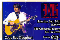
Elvis Tribute & More Saturday, Sept 30 - $39/$45