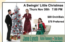
A Swingin' Little Christmas with Jane Lynch Thursday, Nov 30 - $69/$79