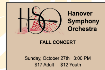
Hanover Symphony Orchestra Fall Concert Sunday, October 27th 3:00 PM $17 Adult $12 Youth