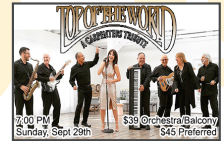
Top of the World A Carpenters Tribute Sunday, Sept 29 - $39/$45