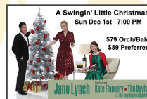
A Swingin' Little Christmas with Jane Lynch Sunday, Dec 1 - $79/$89