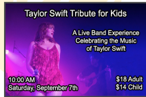
Taylor Swift Tribute for Kids A Live Band Experience Celebrating the Music of Taylor Swift Saturday, September 7th $18 Adult $14 Child