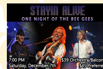
Stayin' Alive One Night of the Bee Gees Saturday, Dec 7 - $39/$45