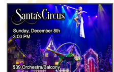
Santa's Circus Sunday, December 8th 3:00 PM $39 Orchestra/Balcony