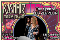
Kashmir The Spirit of LED ZEPPELIN Saturday, Oct 19 - $39/$42