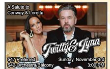
A Salute to Conway & Loretta Sunday, November 3rd $47 Preferred $42 Orchestra/Balcony