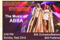
Direct from Sweden The Music of ABBA Sunday, Sept 22 - $45/$49