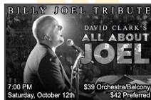
All About Joel Tribute to Billy Joel Saturday, Oct 12 - $39/$42