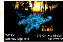
Hotel California A Salute to the Eagles Saturday, Sept 28 - $45/$49