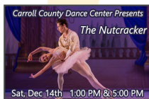
Carroll County Dance Center Presents: The Nutcracker Sat, Dec 14th 1:00 PM & 5:00 PM Carroll County Dance Center Presents: The Nutcracker Saturday, Dec 14 - $20/$25/$35