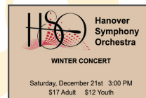
Hanover Symphony Orchestra Winter Concert Saturday, Dec 21 - $17/$12