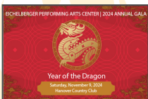
Annual Gala Saturday, Nov 9