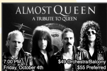
Almost Queen A Tribute to Queen Friday, Oct 4 - $49/$55