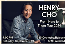
Henry Cho: From Here to There Tour 2024 Saturday, Sept 14 - $35/$39