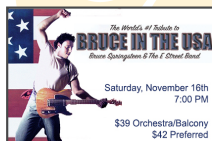
Bruce in the USA Tribute to Bruce Springsteen Saturday, Nov 16 - $39/$42