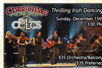
Christmas with the Celts Sunday, Dec 15 - $35/$39