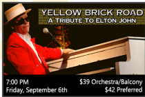
Yellow Brick Road A Tribute to Elton John Friday, Sept 6 - $39/$42

Purchase Tickets online at TheEich.org OR Contact the Box Office 717-637-7086, Monday – Friday 10am to 2pm