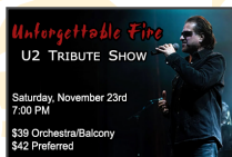
Unforgettable Fire U2 Tribute Show Saturday, Nov 23 - $39/$42